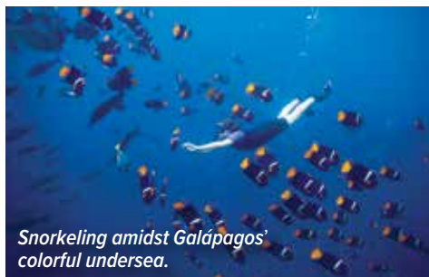
Snorkeling amidst Galápagos' colorful undersea.

This expedition is designed to optimize your individual experience of Galápagos. What would you like to do today? Which of the many activities on offer—from walks to more energetic hikes, to Zodiac shore cruises, to paddling adventures—suits your interests today? Our operation is geared to get you off the ship, out exploring and actively experiencing all the kaleidoscopic wonders Galápagos offers, from swimming with sea lions off a pristine arc of beach, to snorkeling with a passing flotilla of Pacific green sea turtles. Make it yours.