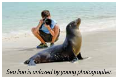
Sea lion is unfazed by young photographer.

The power and relevance of our needs as humans to connect with nature cannot be underestimated. That connection is perhaps at its greatest possible level in Galápagos. The vast number of animals living in the Galápagos archipelago is a major reason you have chosen to travel