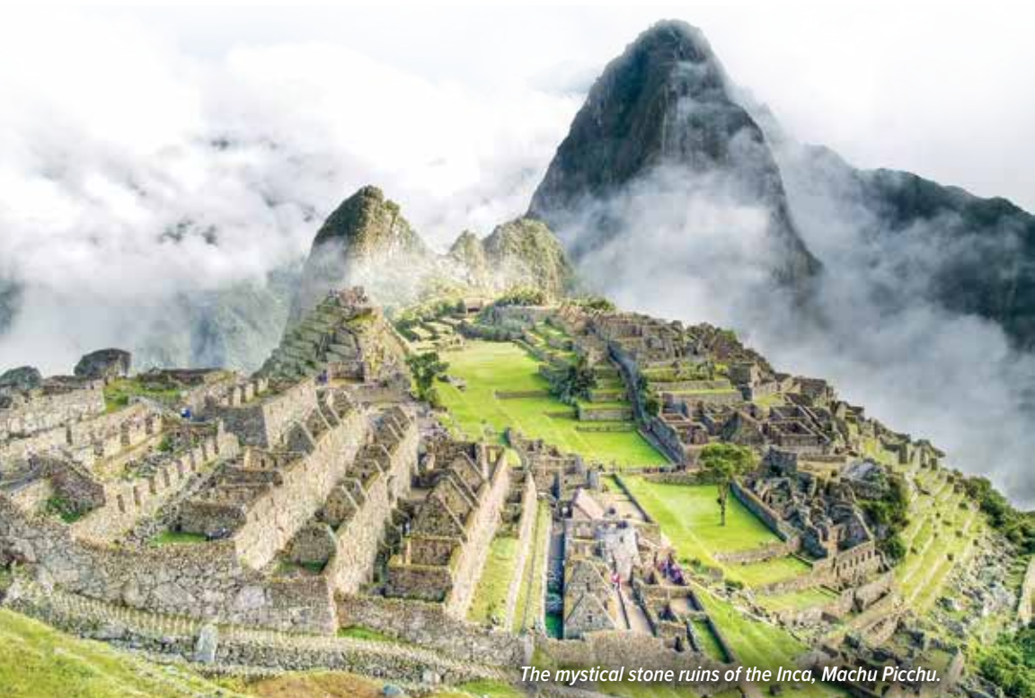
The mystical stone ruins of the Inca, Machu Picchu.

16 DAYS/15 NIGHTS—ABOARD NATIONAL GEOGRAPHIC ISLANDER