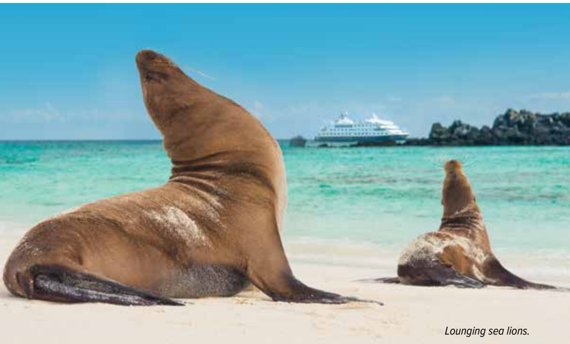
Lounging sea lions.

10 DAYS/9 NIGHTS—ABOARD NATIONAL GEOGRAPHIC ISLANDER