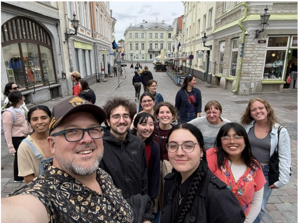
Students and faculty from Oberlin's June language and culture intensive, SOCI 266: The Happiest Country? Finland and its Welfare State visiting Tallinn, Estonia.