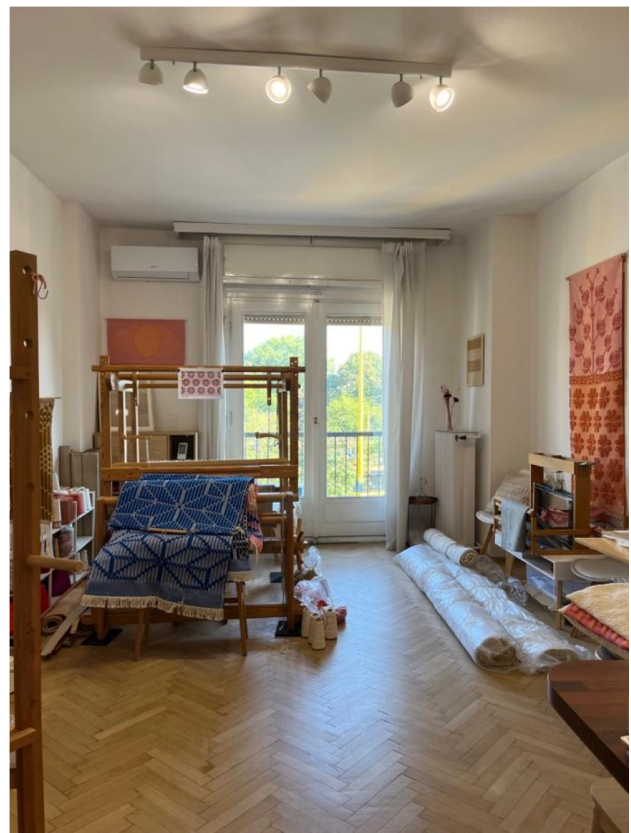
Martina Taylor ('24), OCREECAS 2024 Internship Awardee, conducted two arts internships with Art Quarter Budapest and Threadwritten in Budapest, Hungary.