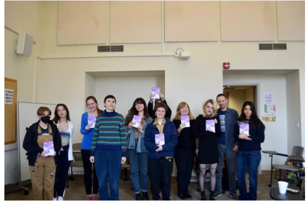
Spring 2025, campus visit by artist and author Victoria Lomasko.