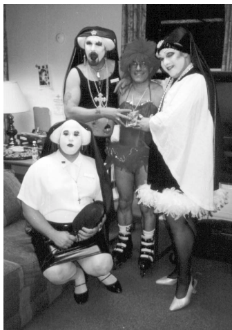
Sisters bless SC figure skater (HZ) in VIP room.