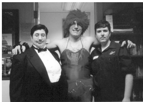
SC members (ZS, HZ, & EF) pose in the VIP room at the Drag Ball