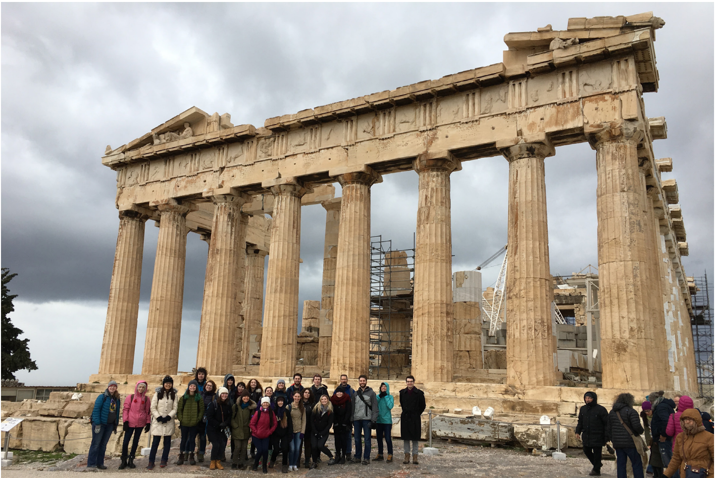
The Winter Term in Greece crew in front of the Parthenon, on a cold January day

Special thanks to my fellow students for generously sharing their gigantes memories.