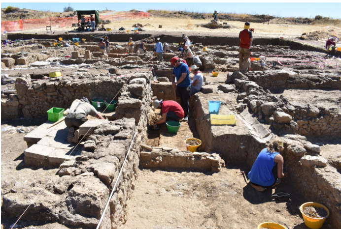
A scene from the dig at Morgantina

The project includes as many as 65 specialists, staff, and volunteers and is divided into teams dedicated to excavations, ceramics, conservation, environmental analysis, geospatial mapping, and database administration. It is represented by volunteers from schools all over the United States and abroad, including juniors, seniors, and a number of graduate students. It is a great place to network with other scholars of classical archaeology, and the project is happy to exchange hard work in the Sicilian sun for the cost of room-and-board. The team lived in the small hilltop town of Aidone, where they had the opportunity to practice their Italian while sipping an espresso or eating a gelato in the shadow of Aidone's Archaeological Museum. Besides nightly family dinners, social events included trips to nearby archaeological sites (such as Piazza Armerina), academic lectures by visiting specialists, karaoke nights,