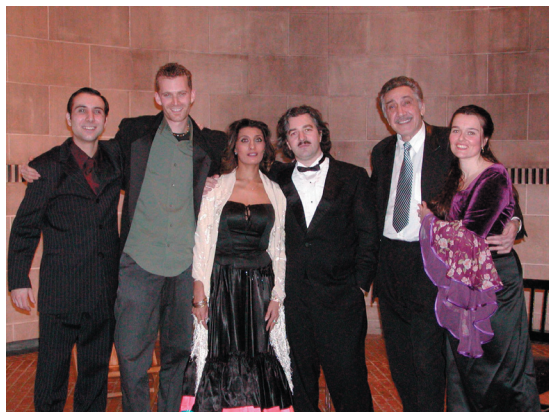
Talisman and the Kolpakov Trio