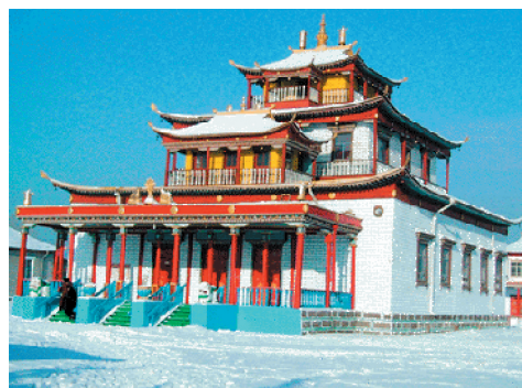
Temple on the Datsan Monastery grounds in the Republic of Buryatia