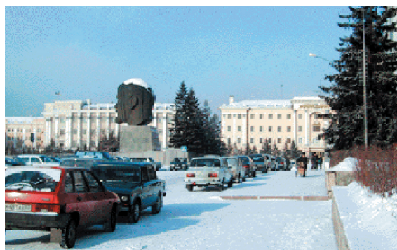
The main square in Ulan-Ude, with the largest head of Lenin in the world!