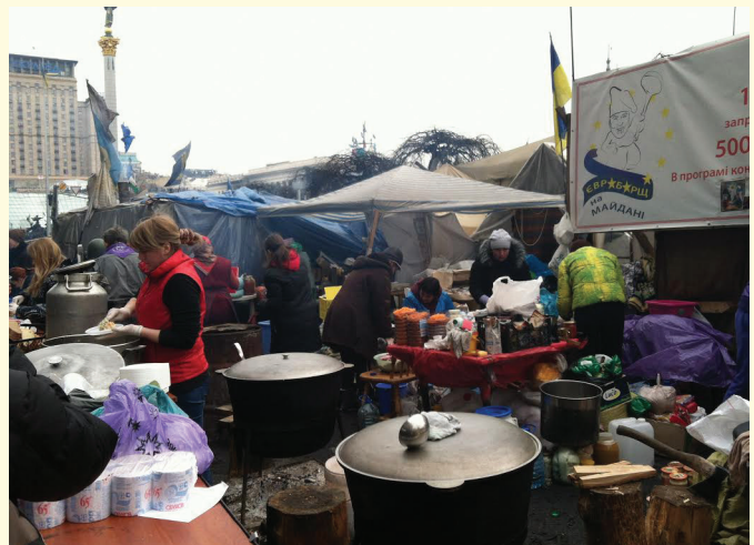
The protest camp on Independence Square

continue to visit different regions of Ukraine to administer an ongoing survey to university students. These visits will contribute to a larger piece that I'm writing on the future of small-scale agriculture in post-moratorium Ukraine.