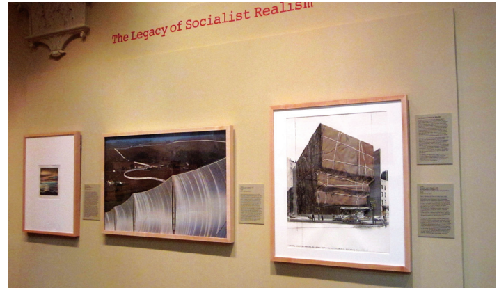
On exhibit at the Allen Memorial Art Museum this spring, "The Legacy of Socialist Realism."

The freewheeling forms of the 1920s were soon curtailed by Stalin's Socialist Realism, which saw punctuation signs stricken from symbolic roles in the artwork itself, relegated to the task of adding emphasis to predictable subtitle text. Question marks disappeared, as Soviet agitprop moved on from cajoling and advising the proletariat through unresolved issues of economy and polity, and simply declaimed what was the absolute truth. And