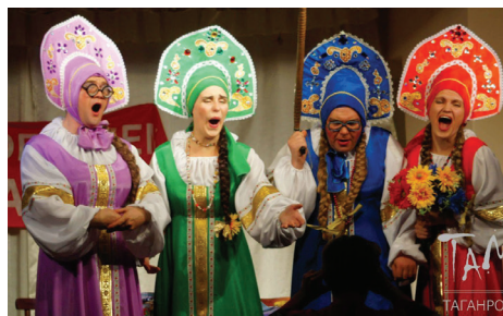
Press photo for production of Baba Chanel