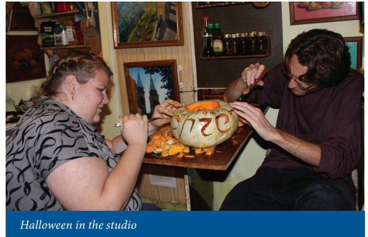
Halloween in the studio

At the ‘Masterskaya,’ I realized how much I enjoy translation from Russian, and took some uncertain steps into investigating the American contemporary art market. The essence of any Russian cultural experience, however, is in the company you keep. Being in the Masterskaya meant being surrounded by artists and designers, and I would often remark that I had hardly any acquaintances that didn’t fit that bill. From my perspective, Taganrog was a city filled with creative types, part of a cohort of incredibly hospitable people who would react enthusiastically to my interest in their hometown. People in Taganrog turn into tour guides without warning. At one point, my friend’s father promised me the ‘unofficial Chekhov tour’ and led me out the front door. He crossed the driveway and pointed to the casement