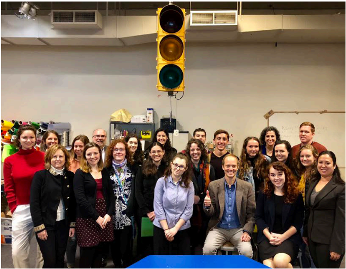
Kick-off event for the design of the Cleveland Environmental Dashboard, involving Oberlin students, faculty, and partner organizations in Cleveland.