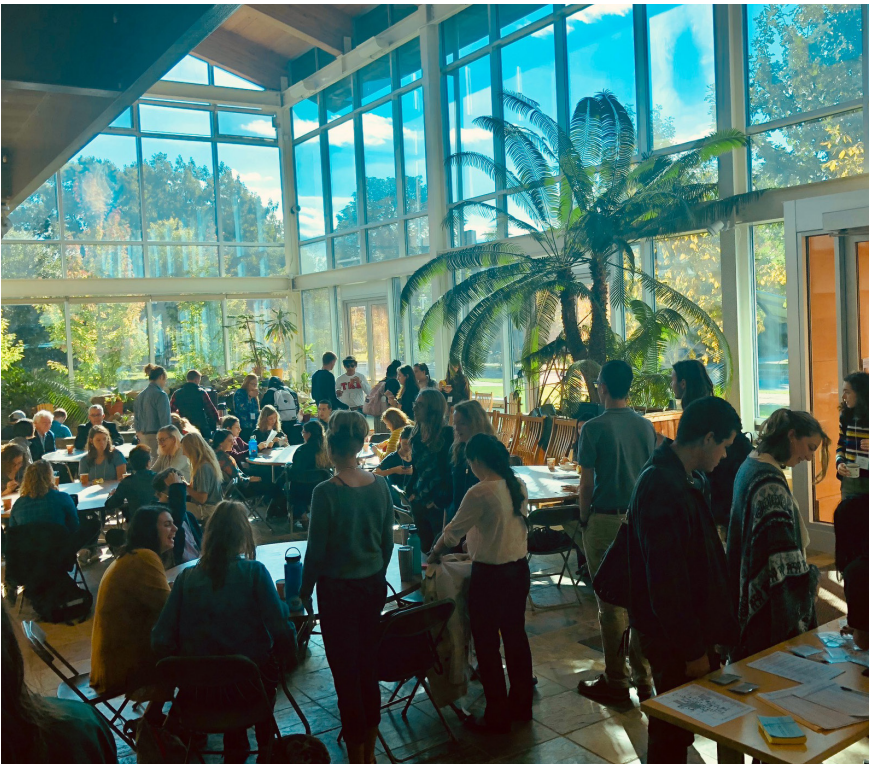
Networking lunch between students and speakers during the NCSE Ohio Student Sustainability Leaders Conference.

The Environmental Studies Program hosted the Ohio Student Sustainability Leaders Conference—a student-run, student-centric conference celebrating undergraduate contributions to the interdisciplinary field of sustainability—last September 29. The conference focused on the theme “Sustainability in Practice.” This event is in partnership with the National Council for Science and the Environment (NCSE) and its other Ohio member colleges and universities: University of Dayton, University of Toledo, Ohio State University, and University of Findlay. The full-day conference engaged student sustainability leaders in both research and career development.