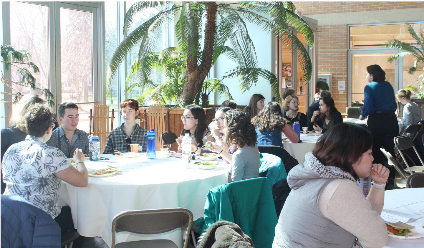
Students, alumni, community members, and faculty converse over a lunch during the Environmental Careers Day in the Lewis Center atrium.