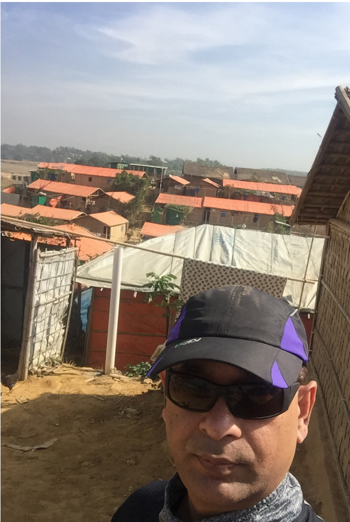
At the Kutupalong Rohingya Refugee Camp in Bangladesh, January 2019.

I recently received a Global Liberal Arts Alliance (GLAA) grant to attend a conference on migration and borderlands in Greece in summer 2019 to interact with scholars from around world who are working on refugee issues, present my Bangladesh research, and develop potential teaching and research collaboration on refugees, sustainability, and resilience. Five Oberlin student