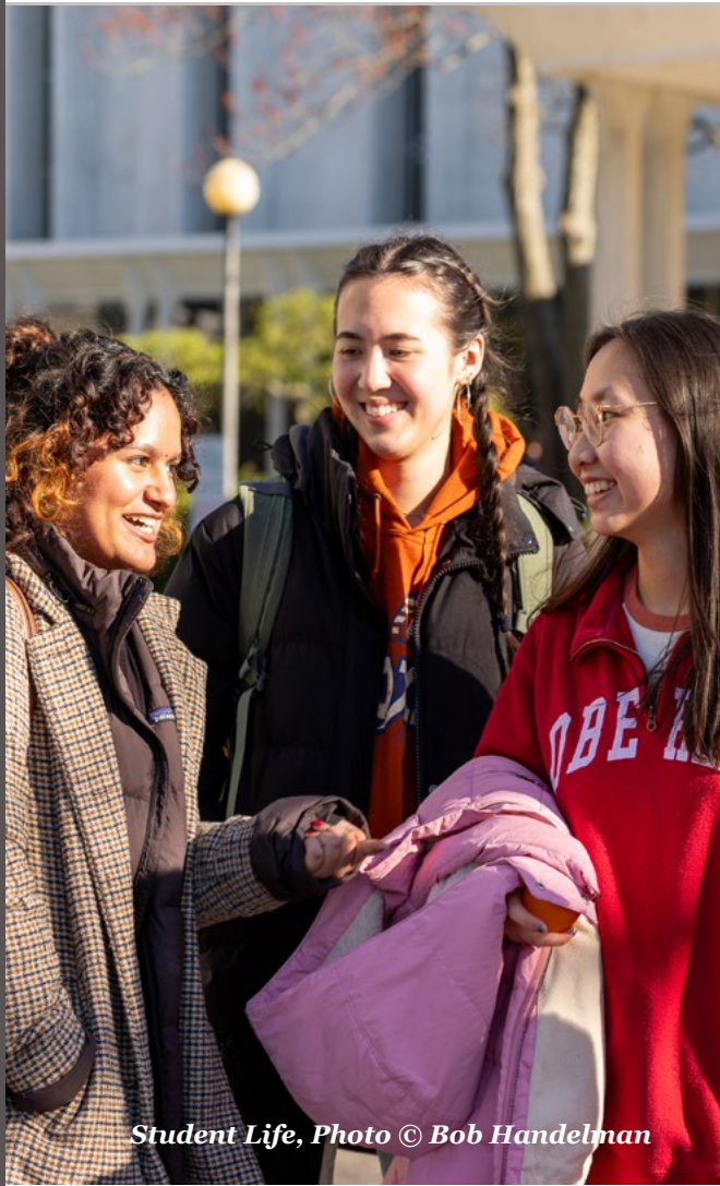
Student Life

in International Studies and external programs; Student Union administrators and supervisors, Student union student staff, student activity advisors, faculty who take students on trips, supervisors, and employers of student staff in dining and conference services.)