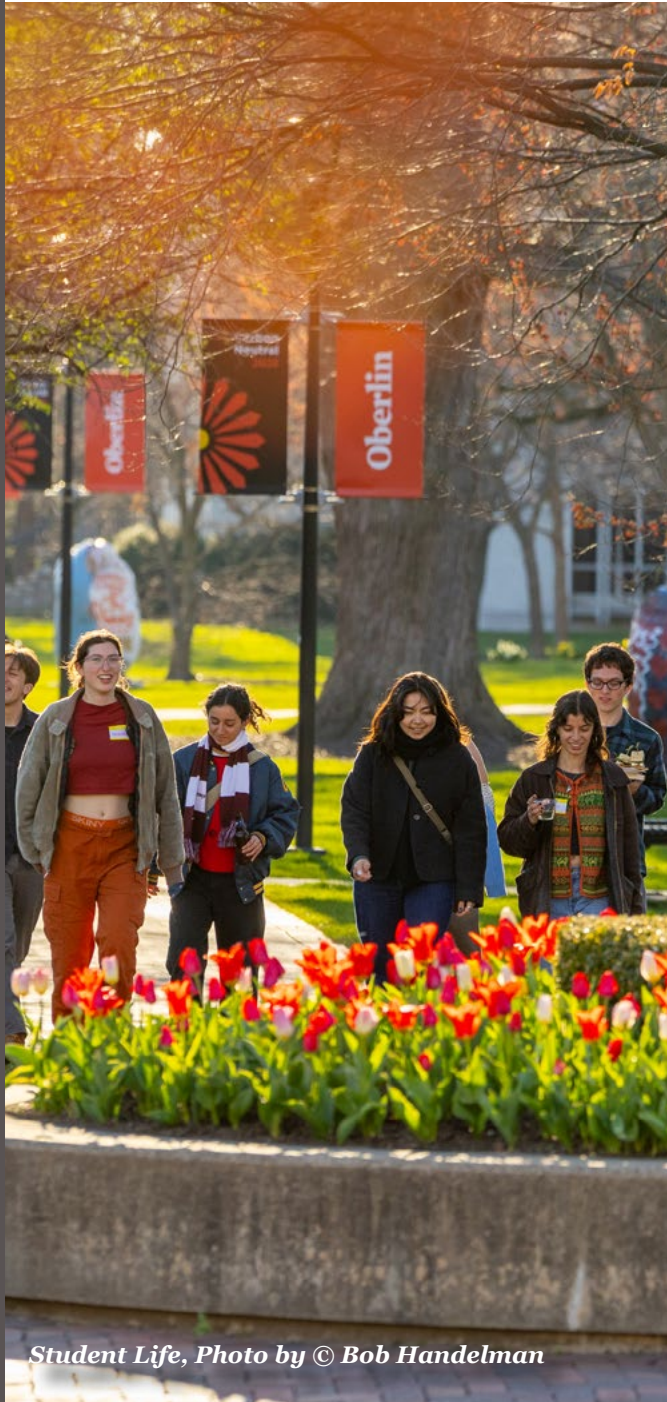
Student Life, Photo by © Bob Handelman

The following information and requirements regarding missing students are provided according to the federal Higher Education Opportunity Act of 2008, section 485(j).