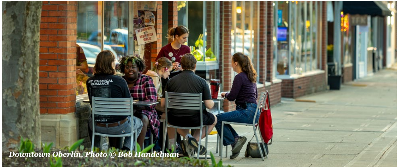
Downtown Oberlin

The Oberlin College Student Regulations, Policies and Procedures Policy on Alcohol, Drugs, and Tobacco prohibit the unlawful possession, use, or distribution of alcohol and other drugs. It is the policy of Oberlin College to enforce all federal and state laws governing underage drinking and illegal drug use. Oberlin College subscribes to the tenets of the Drug-Free Workplace Act and states so in the personnel-related documents given to faculty and staff members. The illegal use of alcohol or drugs by members of the faculty or staff may result in severe penalties up to and including termination.