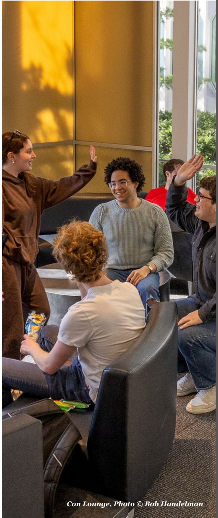
Con Lounge

A complainant has the right to choose whether to notify, or decline to notify law enforcement, except when the allegation is a felony charge under the law. Felonies reported to the College (except to confidential resources) must be reported to law enforcement by the College, as required by Ohio law (Ohio Revised Code 2921.22). Under most circumstances, the complainant may decline to participate in a law enforcement investigation. Where the College makes a report to law enforcement under this section, the College will not share the names of the involved parties without permission from the complainant unless the information is subject to subpoena or other binding legal process by law enforcement, or when the disclosure of information is when the disclosure is necessary to protect the health or safety of the student or other individuals.