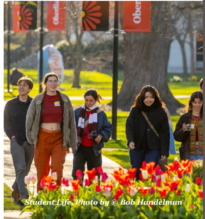
Student Life, Photo by © Bob Handelman

Missing Student Notification Policy - Page 30