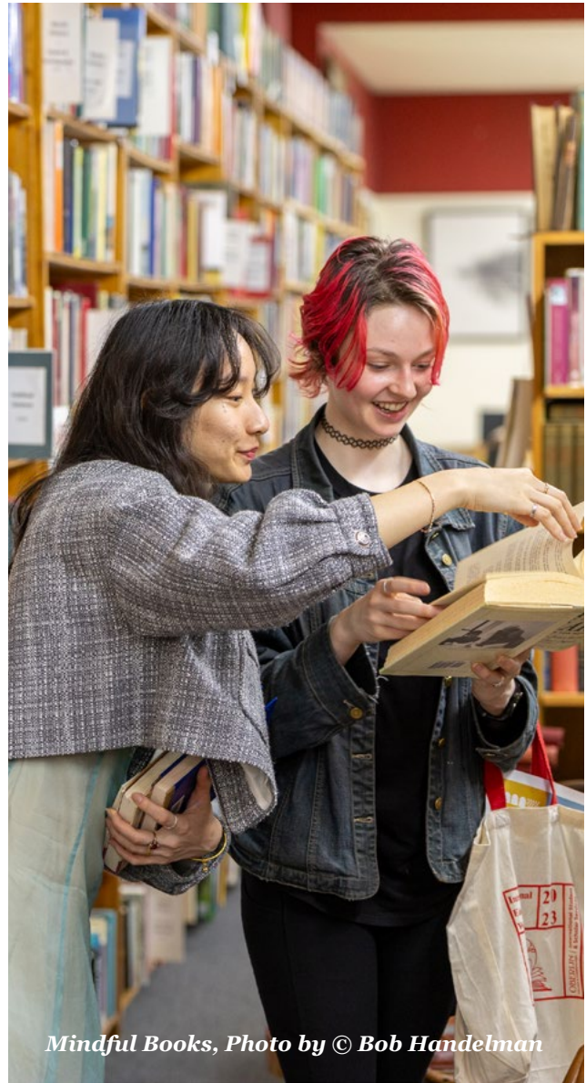
Mindful Books