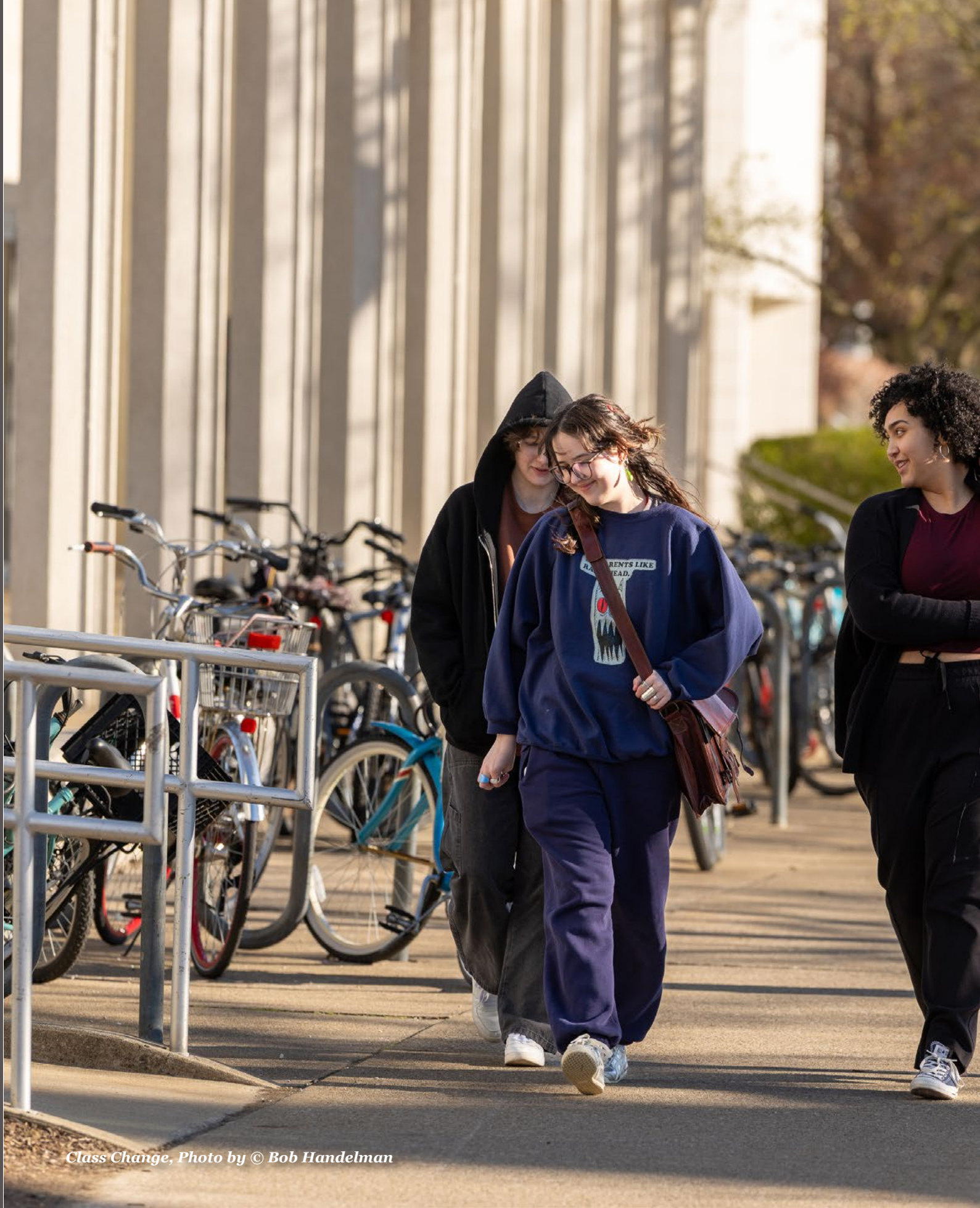
Class Change