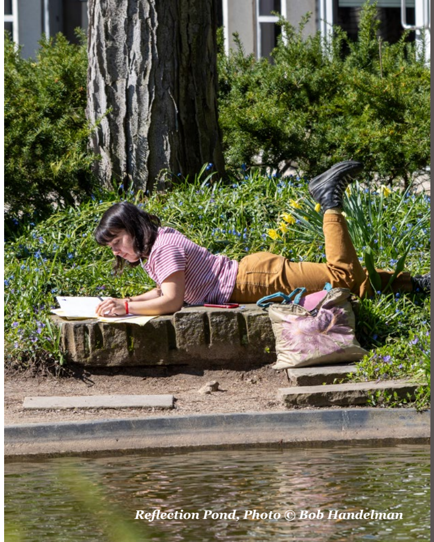
Reflection Pond, Photo © Bob Handelman