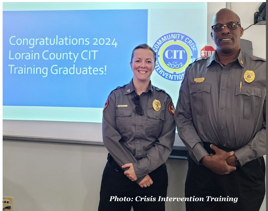
Photo: Crisis Intervention Training

Campus Safety encourages the college community to accurately and promptly report all crimes to the proper police agencies when the victim of crime elects or is unable to make a report. Campus Safety will assist community members in contacting law enforcement officers whenever a victim wishes to do so and recommend to victims who report crimes only to Campus Safety that they also should report the crime to the Oberlin Police Department or governing authority. In cases involving aggravated criminal offenses (felonies, physical assaults, sexual assaults, and hate crimes), the Office of Campus Safety will notify the Oberlin Police Department. Information on criminal activity both on and off the campus is shared to the fullest extent possible under existing laws governing the privacy of records and reports. The Oberlin Fire Department responds to all on-campus fire alarms and releases its authority over the response site after investigating the circumstances precipitating the response. Meetings are held with officials from both the police and the fire departments on both a formal and informal basis, and reports of criminal activity are routinely exchanged.