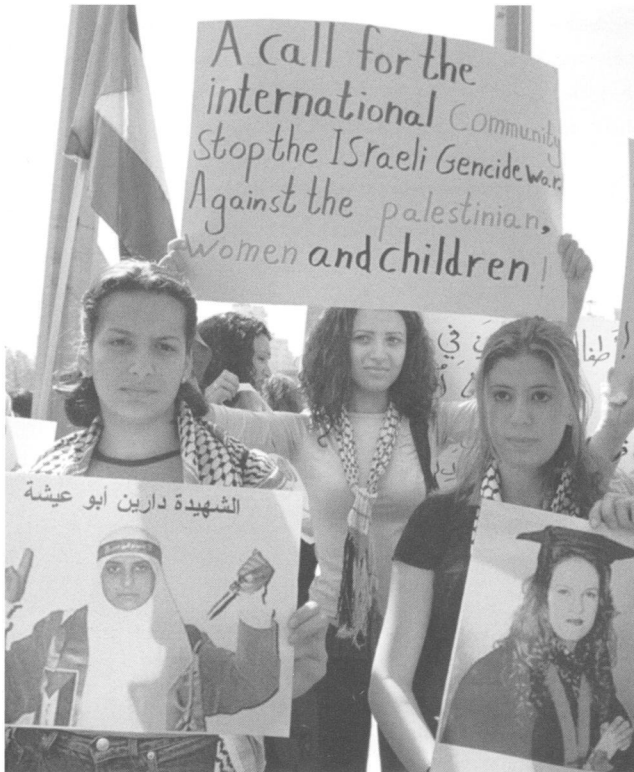
Figure 3 Palestinian women in Beirut hold posters of Daren Abu 'Aisheh (l) and Wafa Idris (r) during an International Women's Day protest and sit-in at the United Nations headquarters in Beirut on 8 March, 2002.

and 215). Such responses also bring to the fore the extent to which Arab women's political passions and anger regarding their subordination along a number of axes – usually sublimated and expressed in less dramatic forms and venues – are underestimated or reduced to reproductive and maternalist concerns by Arab, Palestinian and Israeli men.