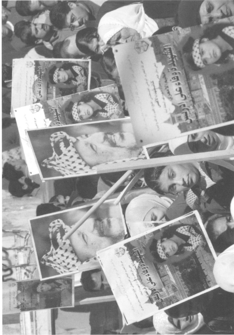
Figure 4 Palestinians holding posters of Palestinian leader Yasser Arafat and Wafa Idris take part in a symbolic funeral for her in Ramallah on 31 January 2002.