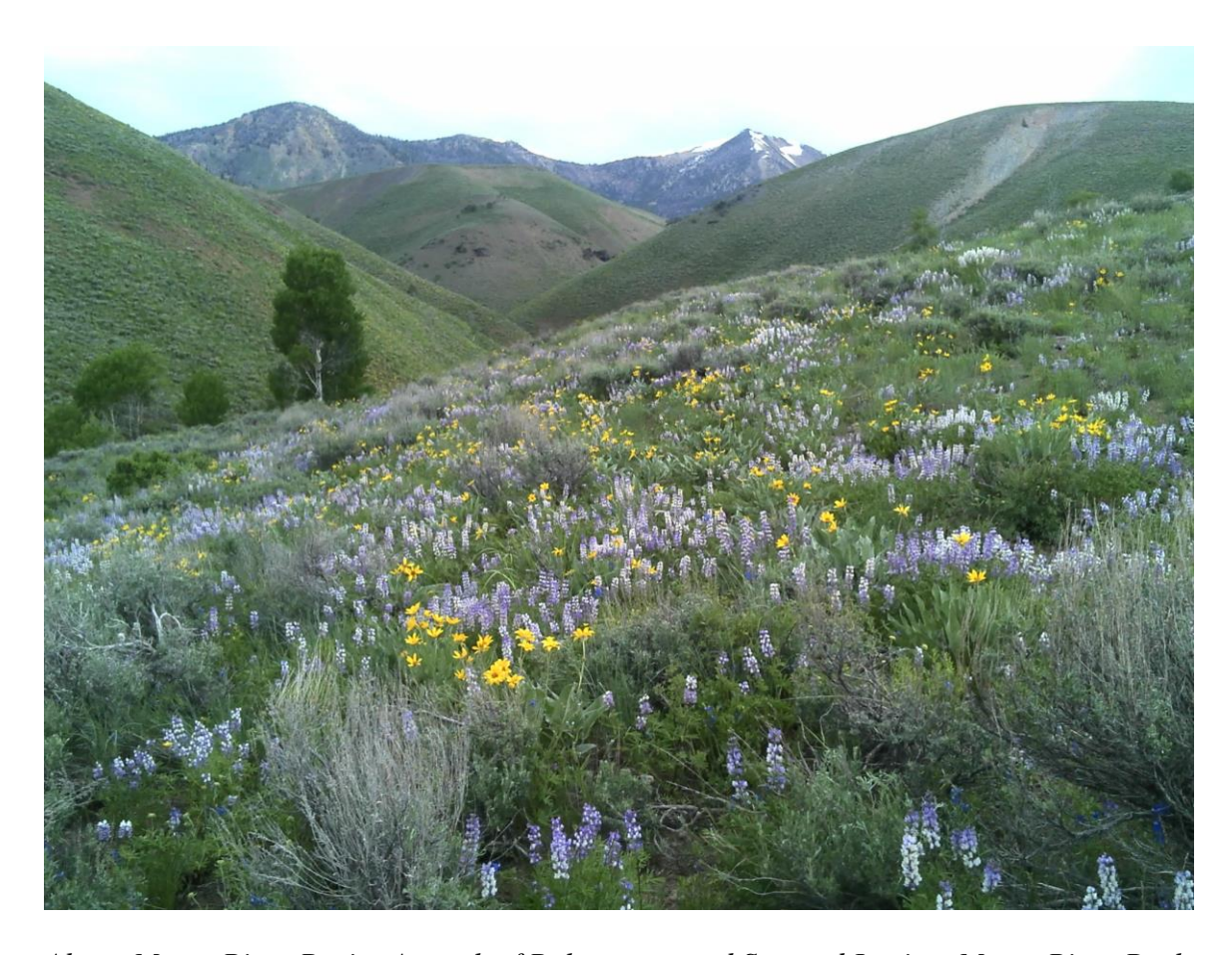
Above Marys River Basin: Arrowleaf Balsamroot and Spurred Lupine, Marys River Peak

From that site I walked up, up until I reached the ridge, where I wrote the "Where am I?" essay. According to my plan, this is where I would "cross the main ridge of mountains to the east." The ridge crest was clear of snow, and all looked good for my plan. I walked 200 yards into the East Jarbidge River basin. The trail disappeared into a huge, steep snowbank. A snowbank very much like the one in the Sawtooths where I sprained my ankle last year. I pondered. I turned back.