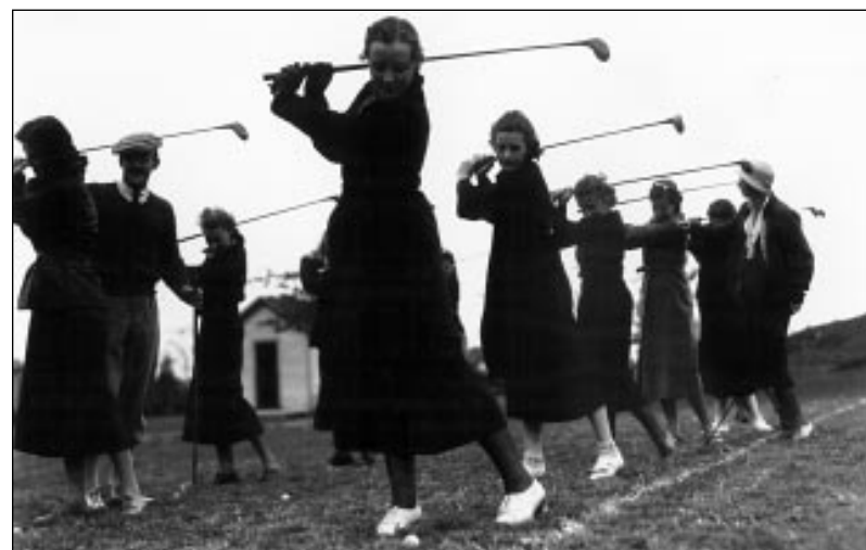
Long before the 1930s, when this photograph was taken, women were learning golf at the College and playing on Oberlin's course.

We know that by fall 1899 students and faculty worked together to lay out and put