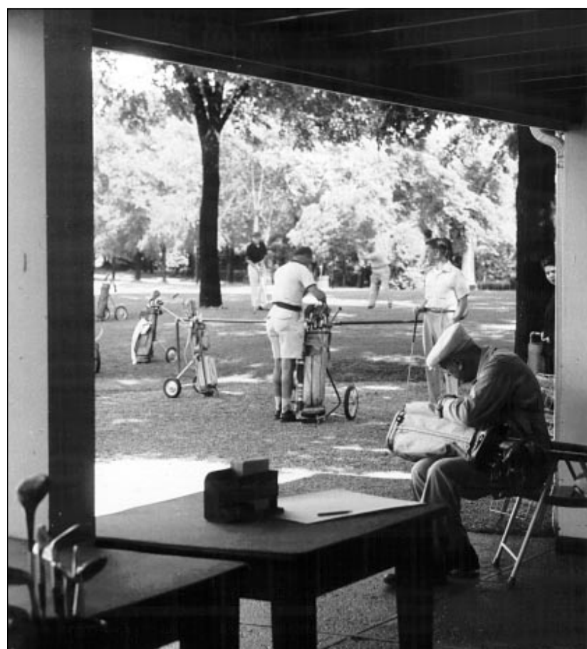
Although College interest in golf was already declining by then, the 1950s were the last decade in which golf played a significant role in Oberlin College culture. By 1952 membership costs in the Oberlin Golf Club had risen from the $3.00-a-year of 1910: Annual dues were $50, and students could play for $10 a season. In 1995 annual dues are about $1000 after an initiation fee of $4000.