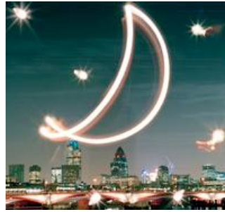
London - a smorgasbord of nocturnal delights!

Run by Robin Ince (winner of this year's TO Comedy Award in the Outstanding Achievement category), The Book Club is on monthly (sometimes fortnightly) at the Albany, and each night boasts a huge bill of established comics doing unusual things. Between acts, Ince reads excerpts from abstruse books. Fantastically weird. The Albany, 240 Great Portland St, W1 (020 7387 0221). Check listings for next event.