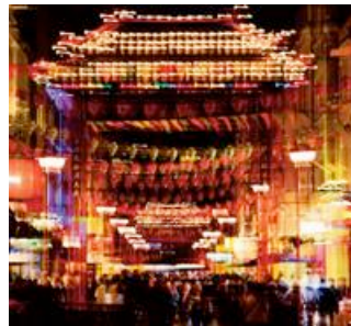
Hit the Chinatown - eat well on Gerrard Street

Time Out London magazine (Issue 1853) London's Best Nights Out Ever! This week Time Out shows there's more to London's night life than two pints of lager and a packet of crisps and offers a crash course in cultural hedonism. [ Buy Now ]