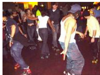
Strap wheels to your feet every Thursday & Friday at Canvas